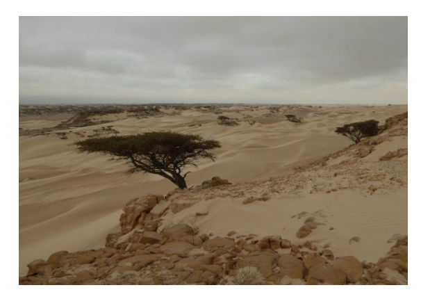
Camping between black rocks and white sanddunes Individual camping tent