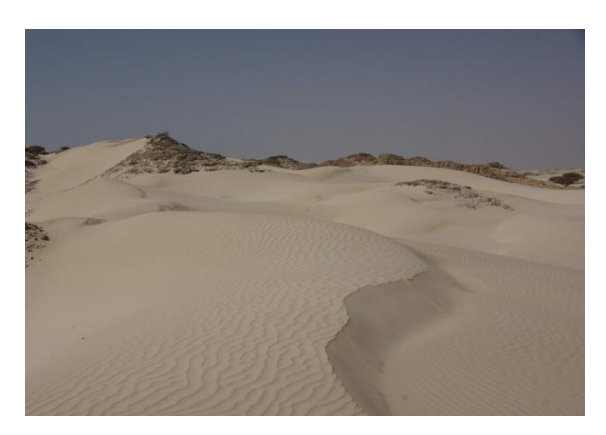
Camping between black rocks and white sanddunes Individual camping tent

- Walking time : 4 to 5 hours - Height differrence : +200m/-200m